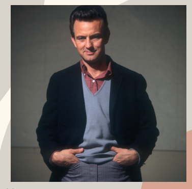
12. Tommy Collins Ernest Tubb 78s (Tommy Collins) Music America MA 106 (©) 1980

Take this house with 14 rooms, I don't want my car That new Mach 6 means no more to me than a Chinese pushcart You can have my coin collection and all I really say I just want my Ernest Tubb 78s!